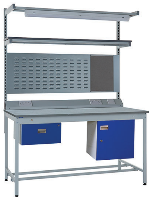
ESD WORKBENCH KIT 3 WITH TRIPLE DRAWER UNIT