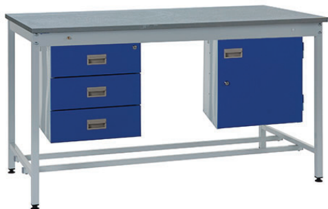
ESD WORKBENCH KIT 1 WITH TRIPLE DRAWER UNIT