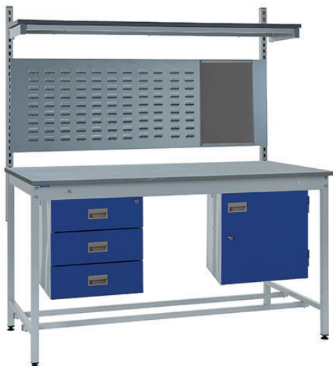
ESD WORKBENCH KIT 2 WITH TRIPLE DRAWER UNIT